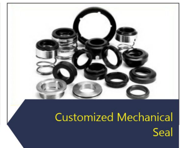
Customized Mechanical Seal