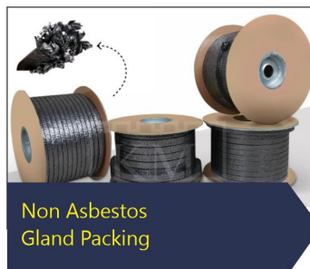
Non Asbestos Gland Packing